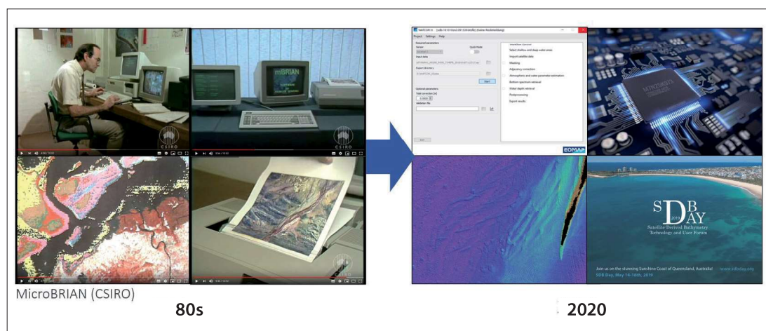
Fig. 1: Time-lapse of the development of hydrographic remote sensing. In the early 80s satellite data were analysed with intense man power efforts and required the best processing capacities which were available at that time. Nowadays analyses are done in operational software workflows with processes being directed to graphic cards and cloud environments. Dedicated conferences deal with this former niche topic of hydrographic remote sensing and data are integrated in different hydrographic and related applications

found its way to different applications, which are outside the standard domain of hydrographic applications. The data are being used by survey and offshore industry in almost daily use, and found in the harmonised European bathymetric grid of EMODnet bathymetry and the global grid of GEBCO. In all these mentioned projects – except the SHOM spatiocartes – the evolving German expertise, with intense involvement of EOMAP, played a major role. Without systematic long-term developments, the current status of hydrographic remote sensing would be different.